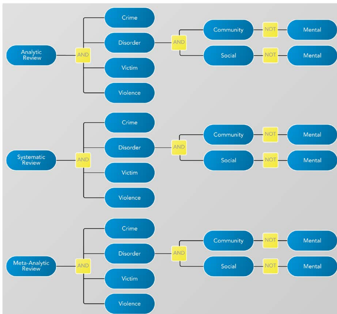
Figure 1: Search terms for systematic review